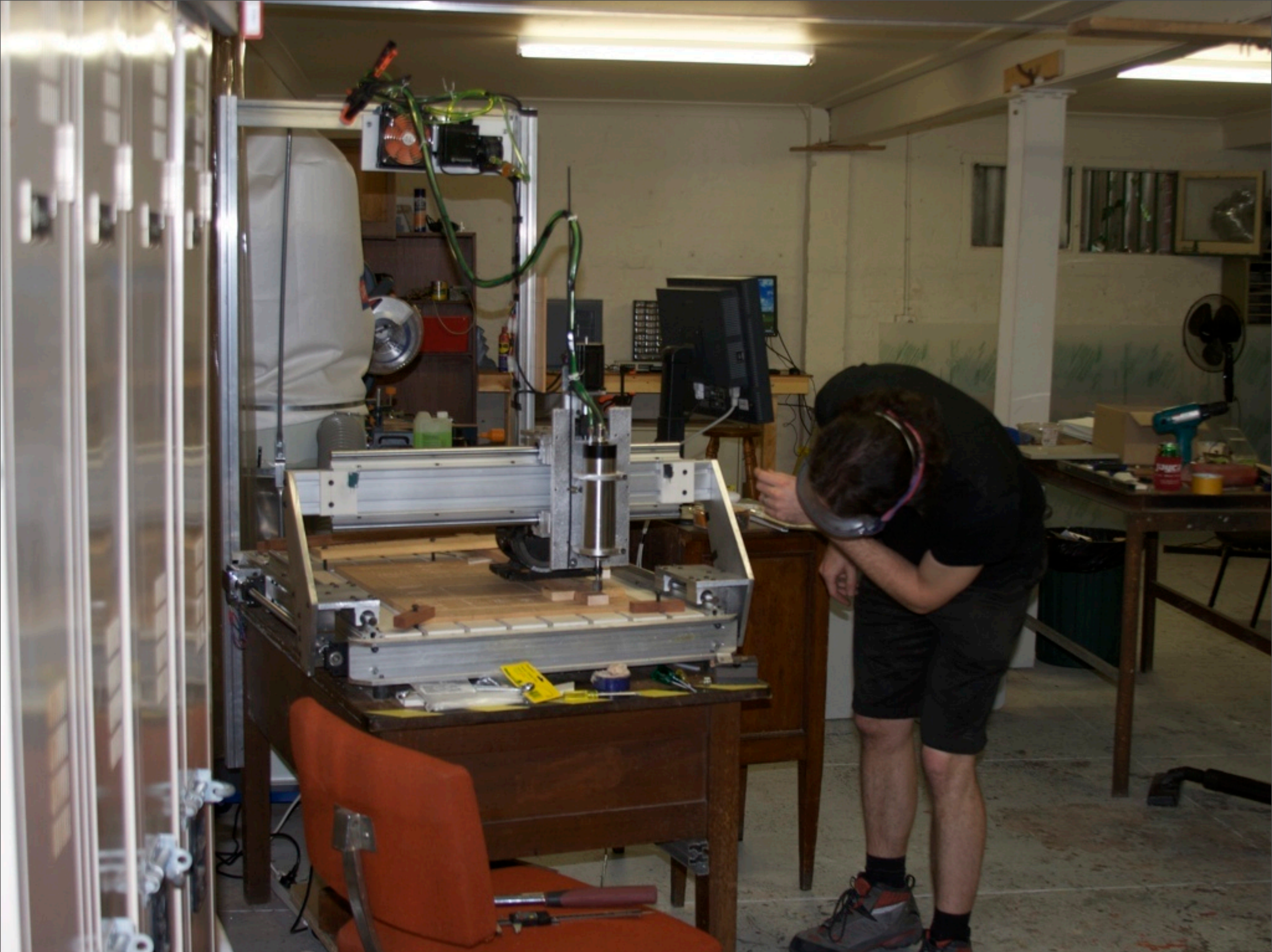
Saturday, 10 April 2010